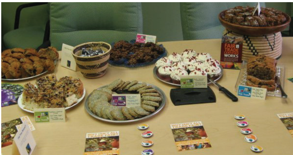
MCIC staff members prepared Fair Trade snacks for a Coffee Break to kick off Fair Trade fortnight on April 27

MCIC kicked off this year's Fair Trade Fortnight with a Fair Trade Coffee Break at the MCIC office on April 27. MCIC staff members prepared snack items made with Fair Trade ingredients such as sugar, chocolate and tea. Take a look at more pictures from the event on our Facebook page.